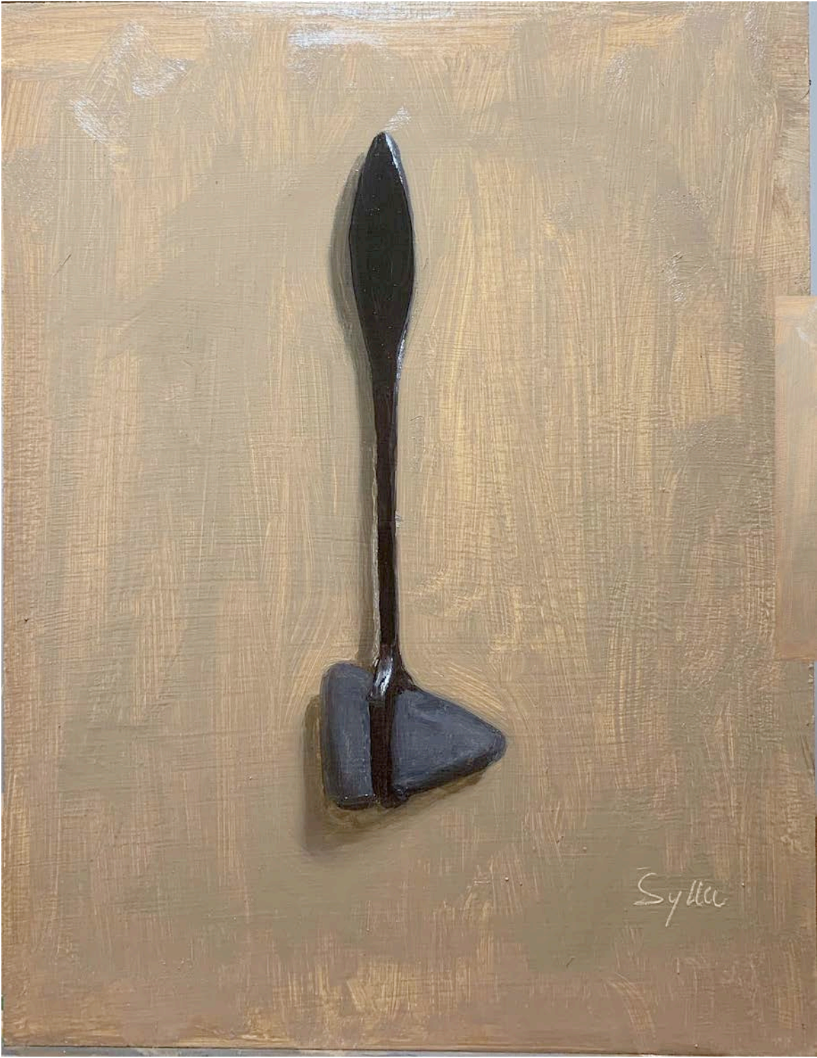
© The Student's White Coat Mohamed Sylla